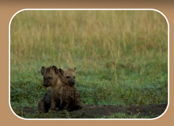
Focal Points Networks