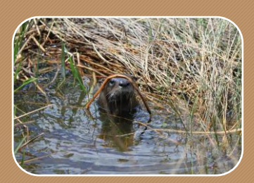
Animal disease notification System