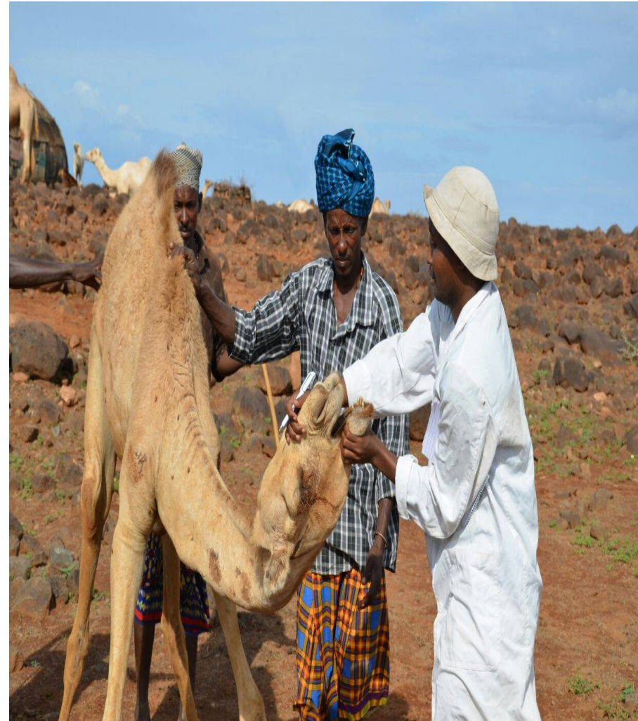
Ambulatory services by VPP's