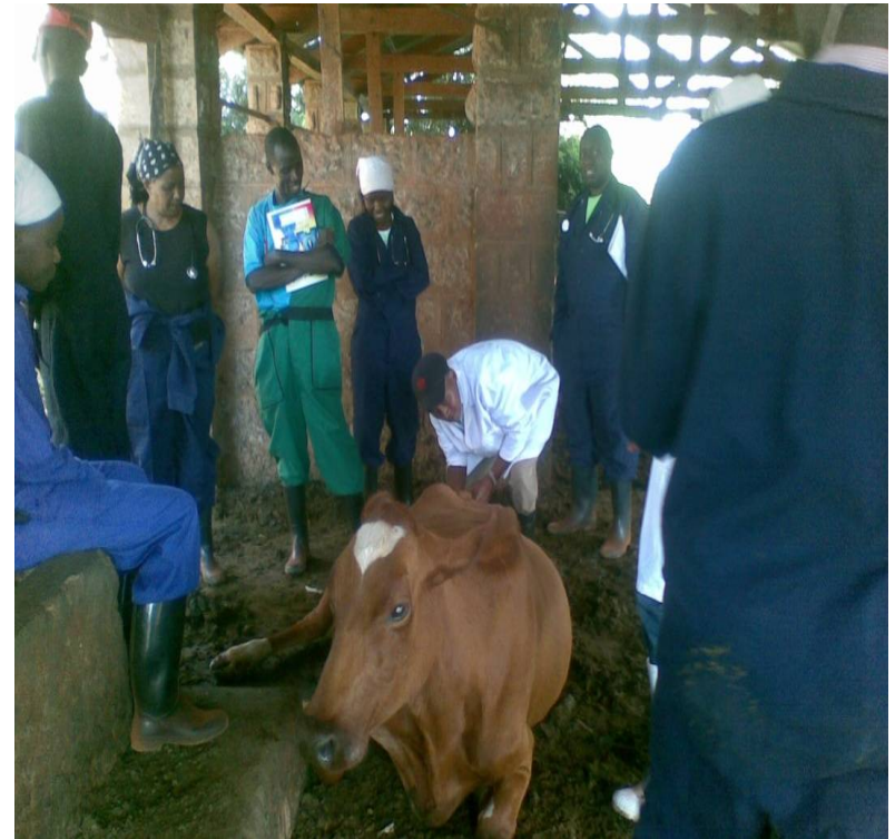
Practical oriented training of VPP's in Kenya