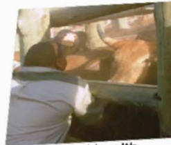
Animal health technician