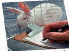
Laboratory animal technologist