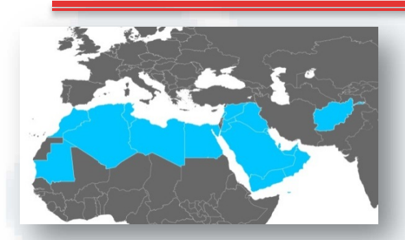
North Africa & Middle East