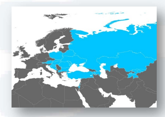
Central & East Europe