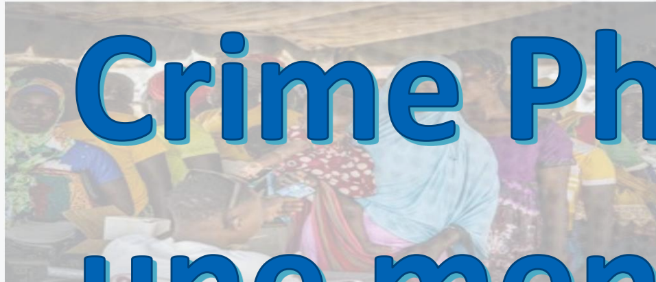
Boko Haram fighters in northern Nigeria. Up to 500,000 people are estimated to be at risk of malnutrition in the region. In the background, a fortified flood plain in the Kongoussi, Kinshasa region.

Fake medicines kill almost 500,000 sub-Saharan Africans a year: UNODC report