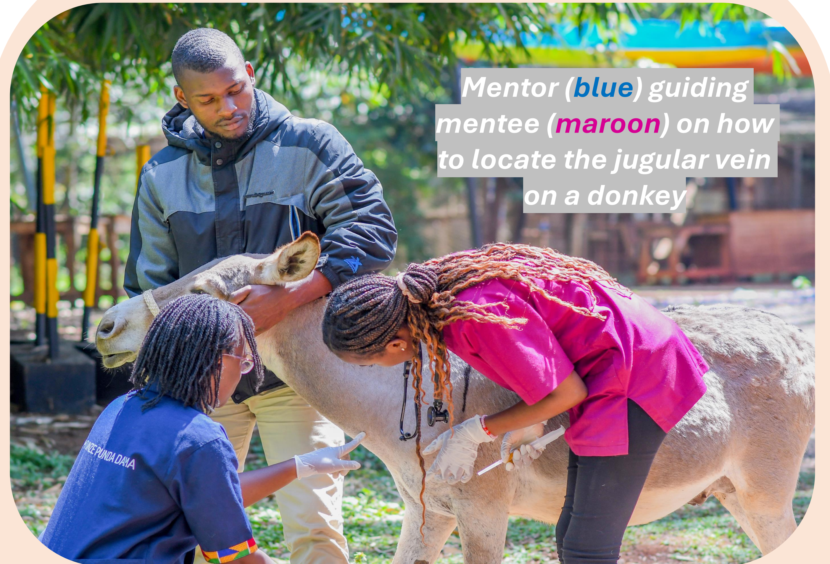
Mentor (blue) guiding mentee (maroon) on how to locate the jugular vein on a donkey