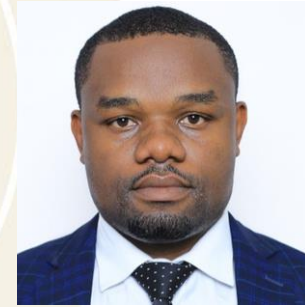
Rajab Awami Training