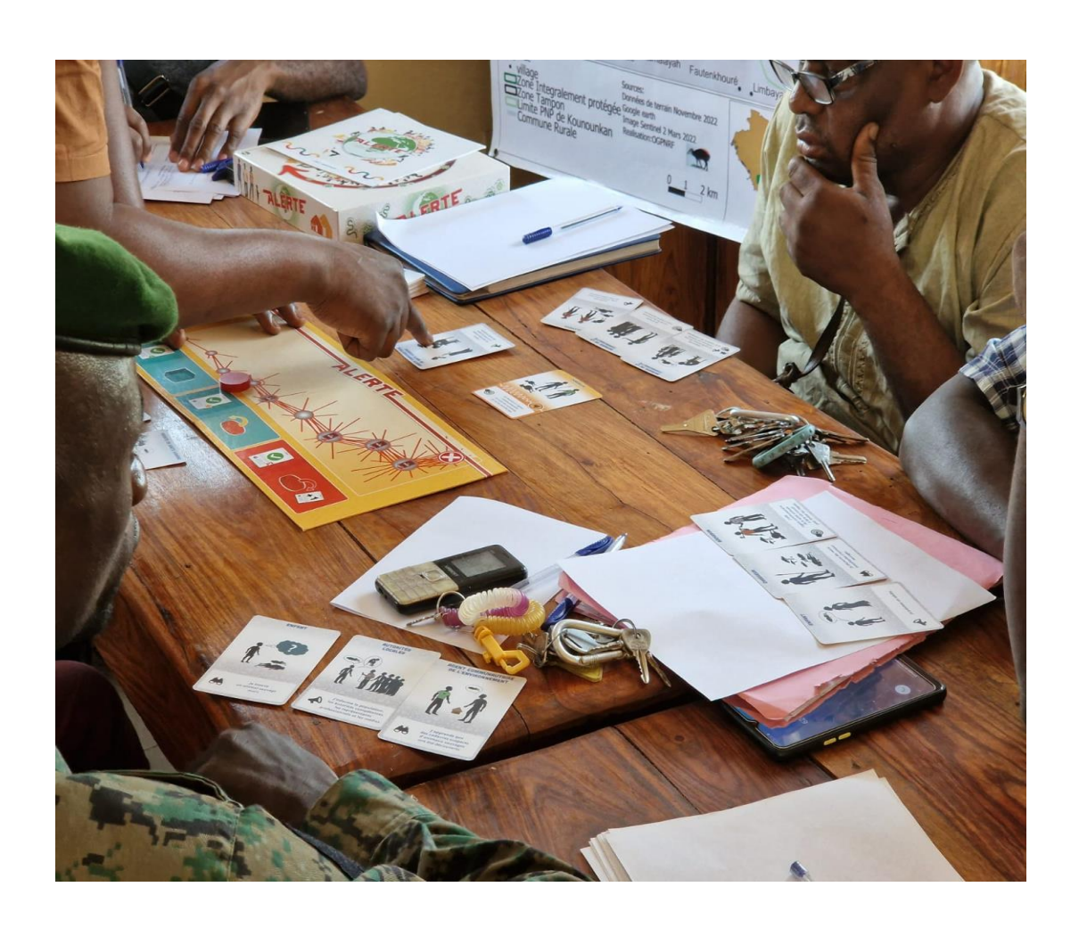
Figure : A game session led by a facilitator in Guinea