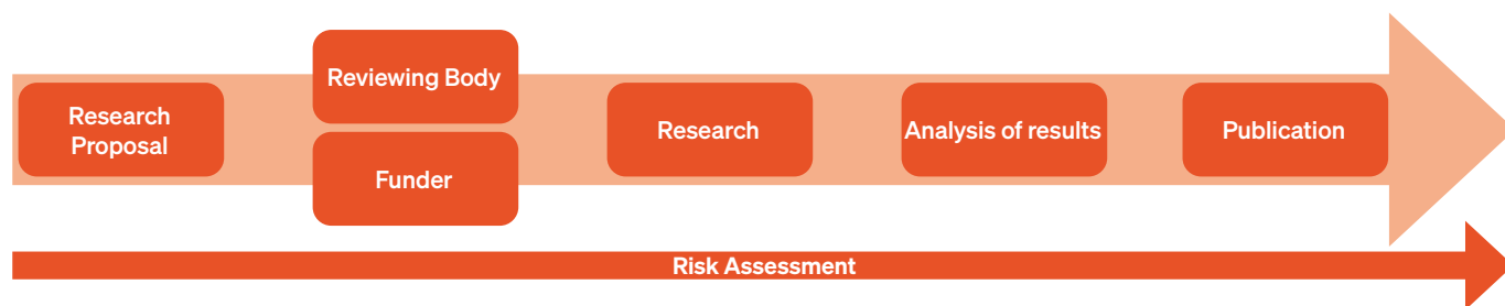
Figure 1 Risk assessment as a continuing process throughout the research life cycle

Structured risk assessment should be conducted as early as possible and throughout the research life cycle. Researchers and institutions should take practical steps to evaluate not only the benefits but also the possible risks related to the research. Risk assessment should take into consideration the likelihood and consequences of research results or products being accidentally or intentionally misused but should also consider the consequences of not doing this research. Vaccine research has per se dual-use implications as it deals with pathogens in order to develop vaccines. However, the products of this research are among the