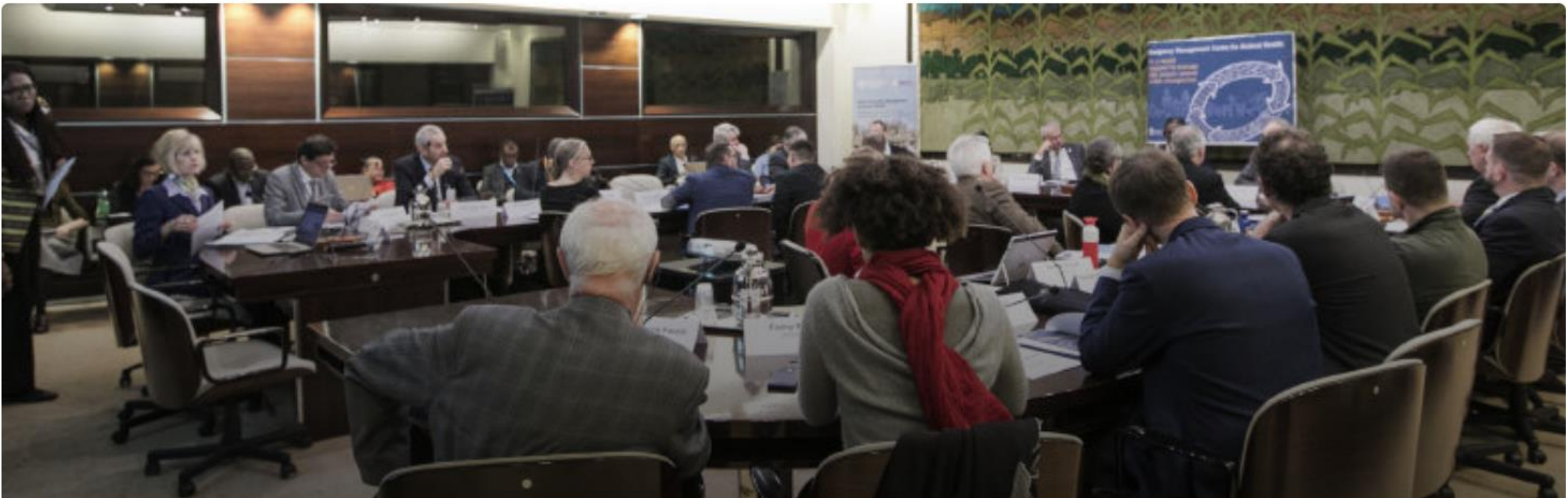
Emergency Management Centre (EMC)