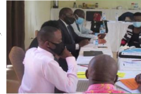
Above: A group discussing the Strengths, Weaknesses, Opportunities and Threats (SWOT) in relation to Zambia's animal health sector.