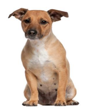
Dogs 4 mil + 2 mil cats.