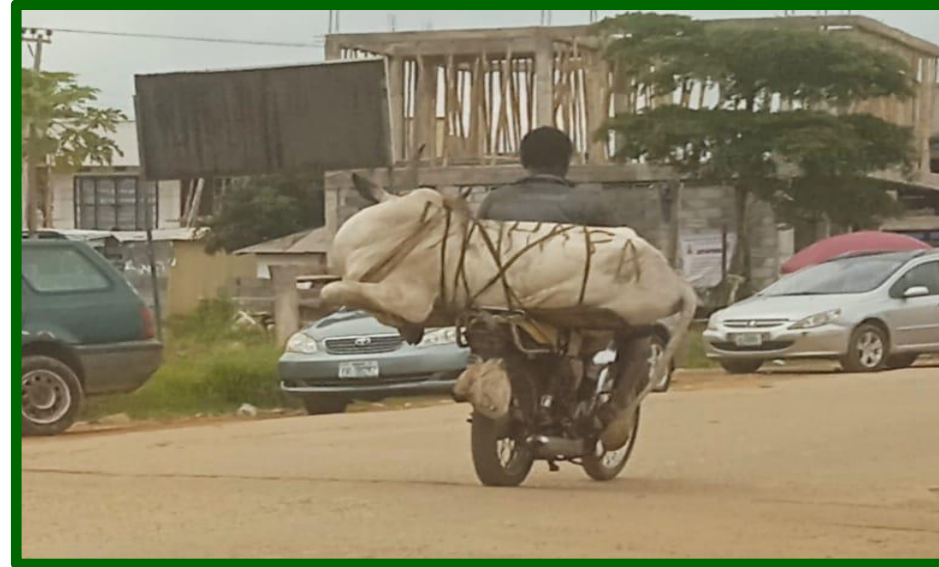
Inappropriate transport of cattle during festive period