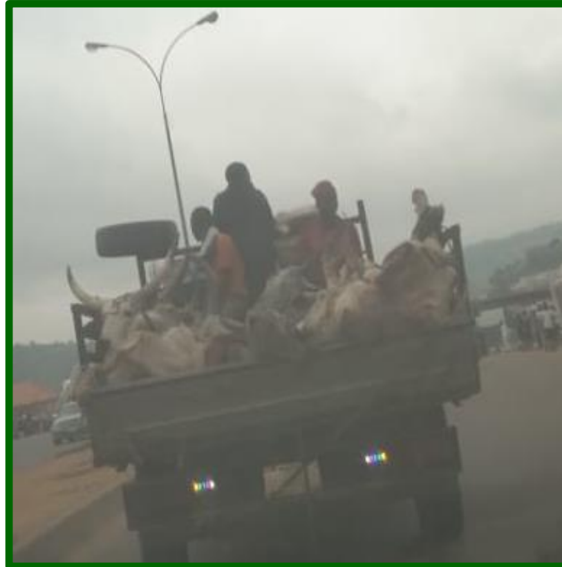
Truck and overload not good transport means