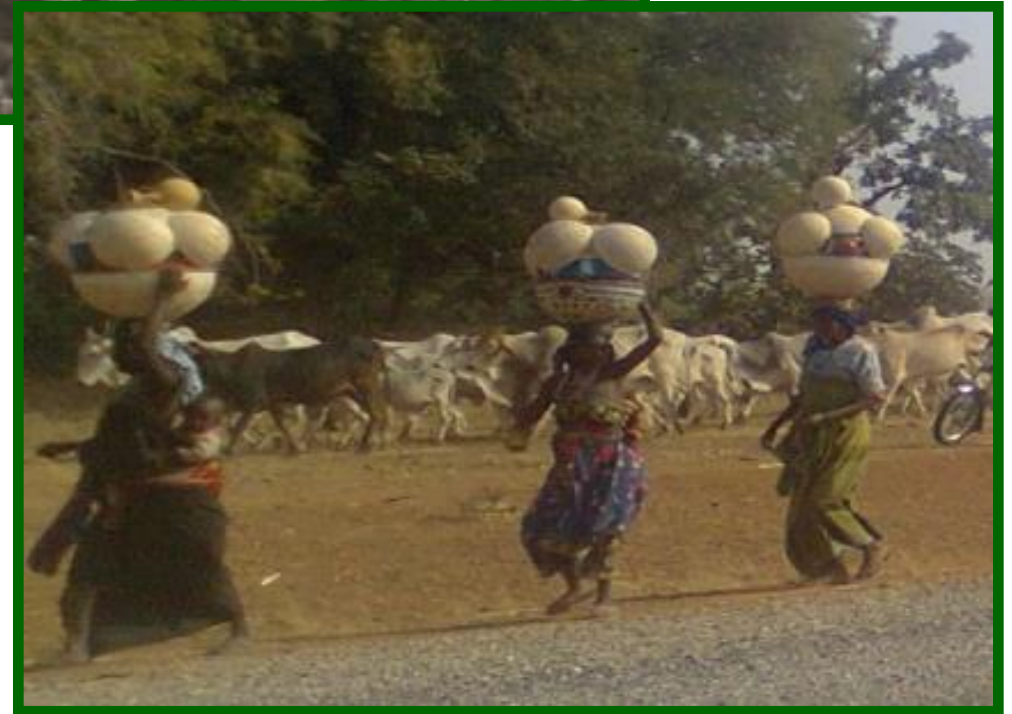
Cattle moving long distances for grazing