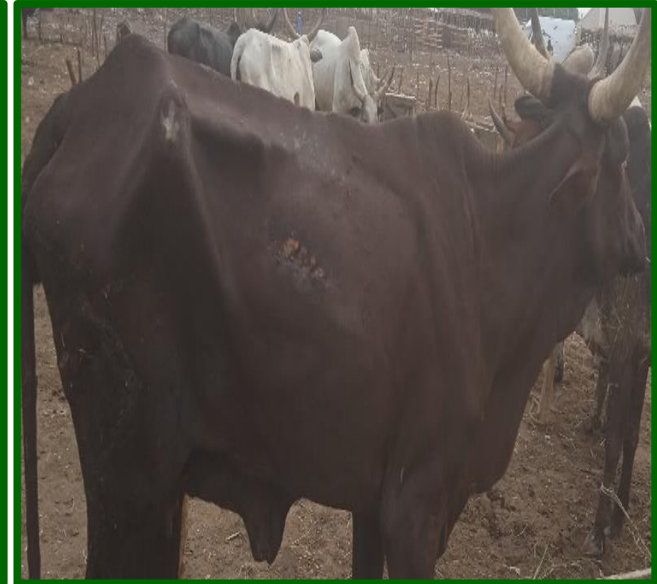
Bruises on cattle due to poor mean of transport