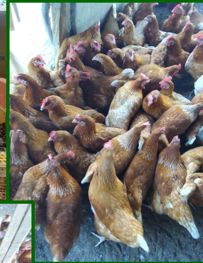
Spent layers kept ready for sale at live birds market in Jega Kebbi state