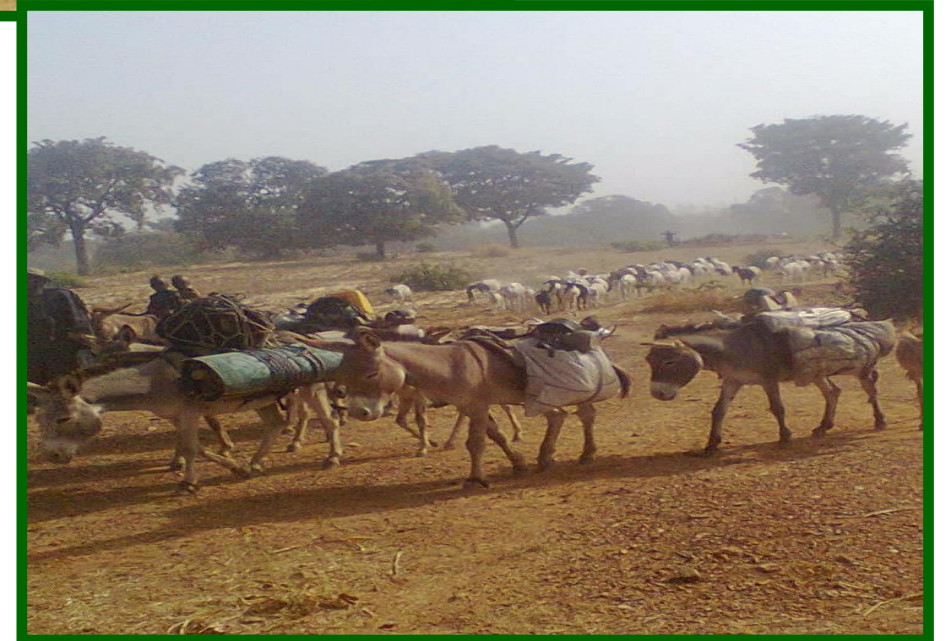
Camels and Donkeys seen as beast of burden for transportation, plough etc.