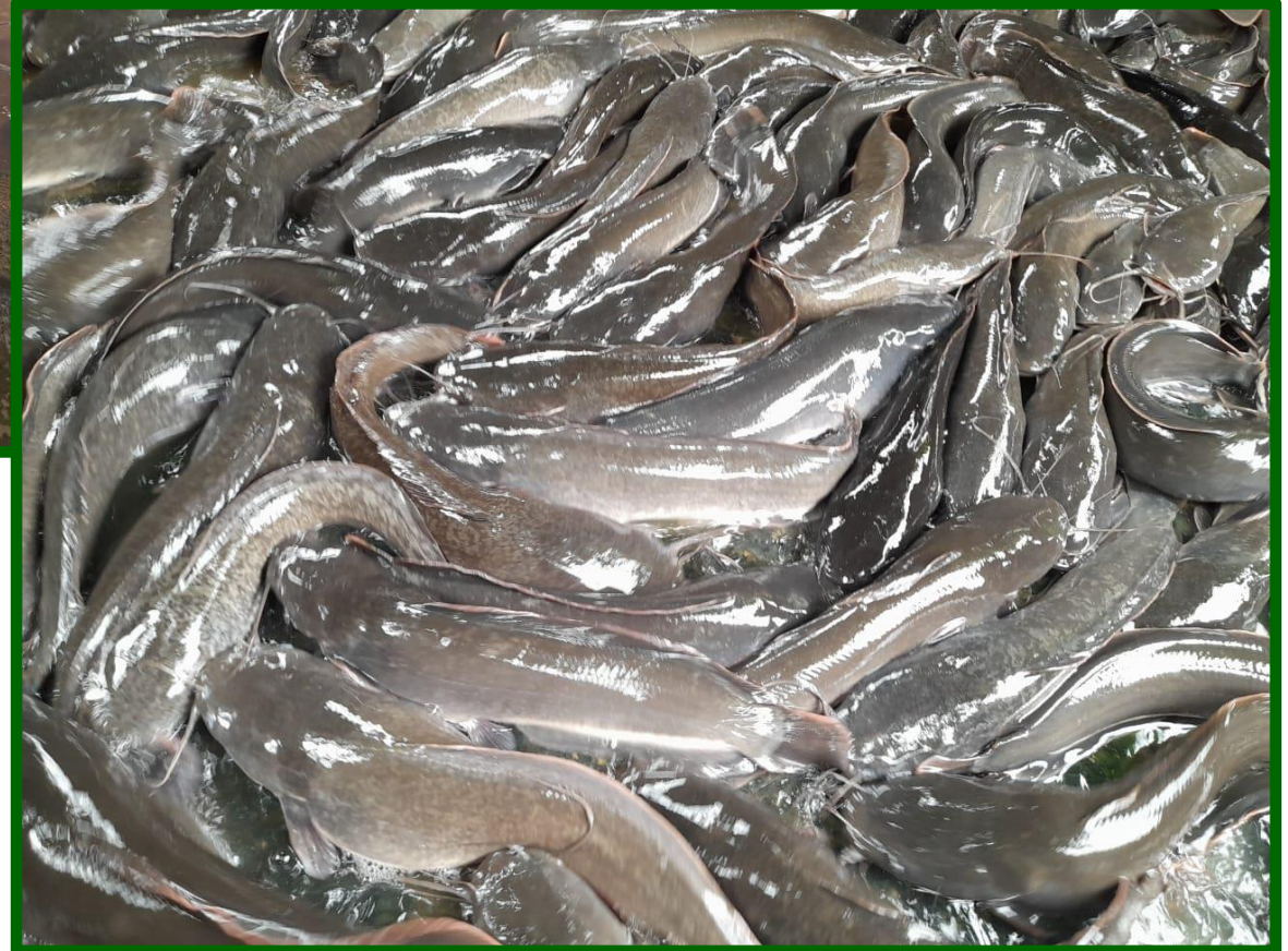
Small scale fish farm in Adamawa State