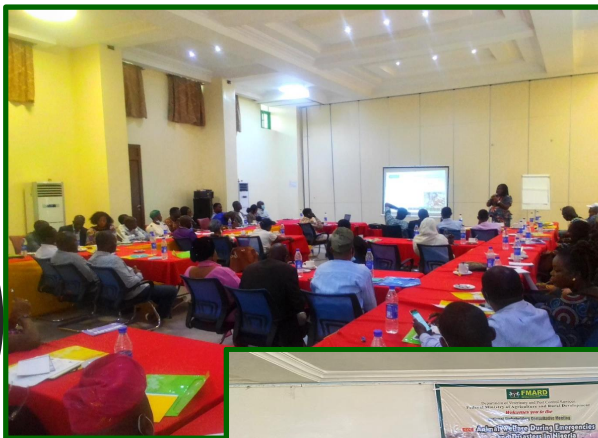
Workshop on Relevance of Animal Welfare March, 2022

Increasing Awareness among stakeholders ...2/3