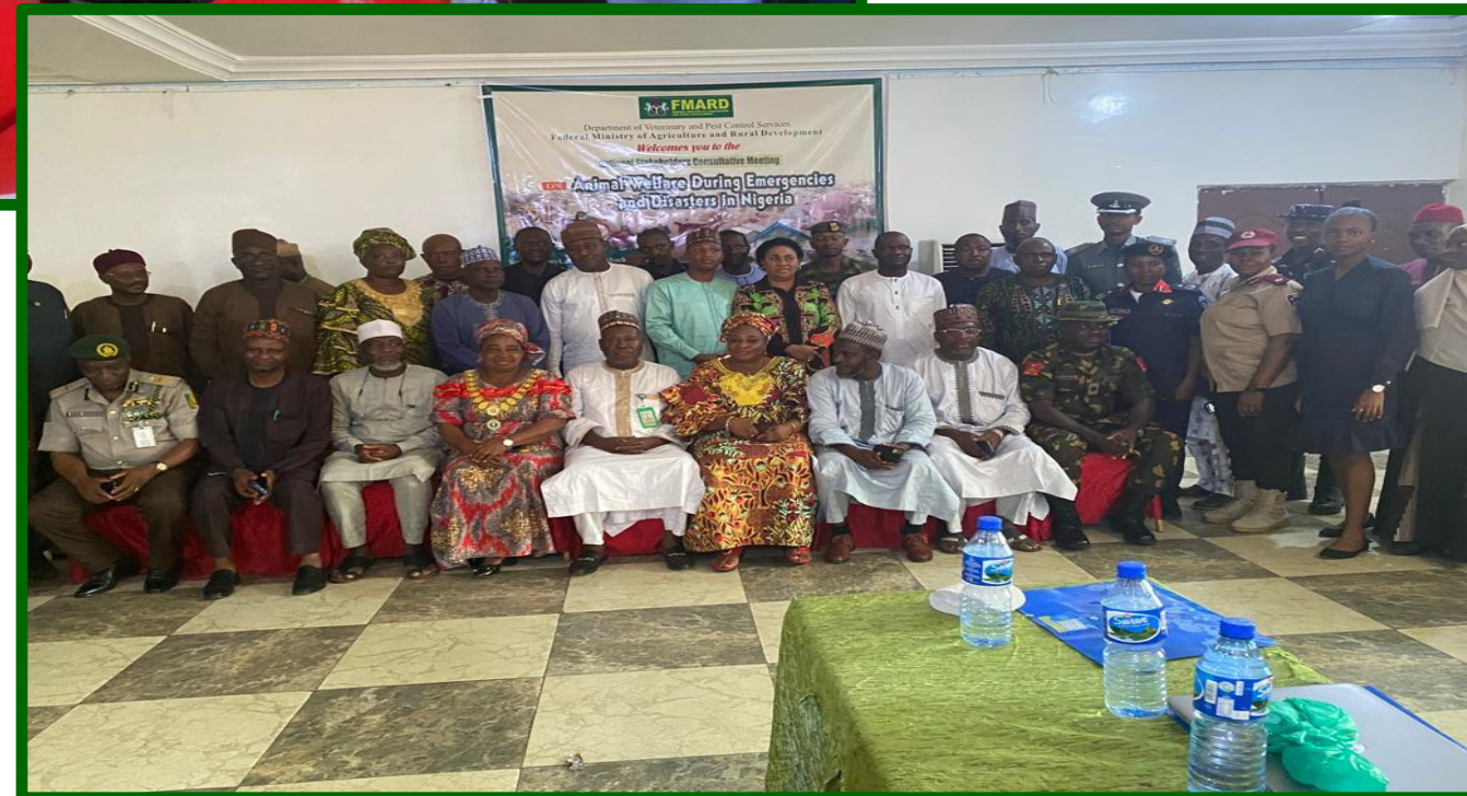
Stakeholders consultative meeting on Animal welfare in Emergencies and Disasters