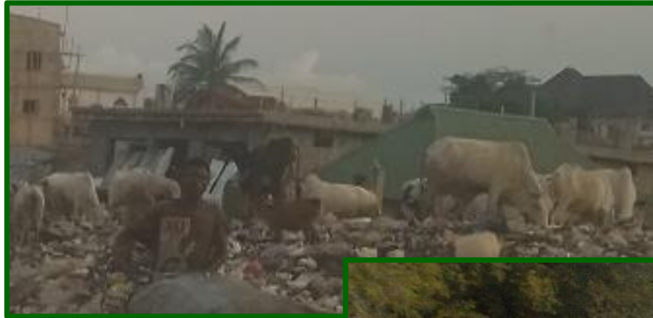
Cattle scavenging for feed at the refuse dumps