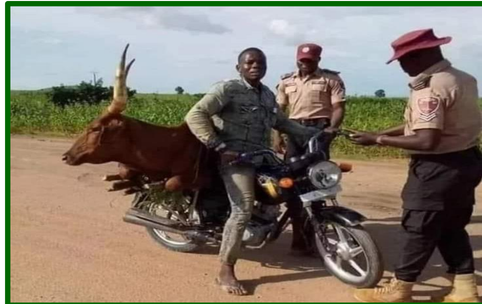
FRSC officials querying strange method of transporting cattle on a motorcycle