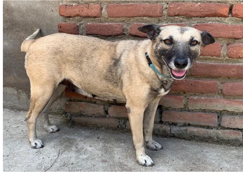
Two months after treatment started