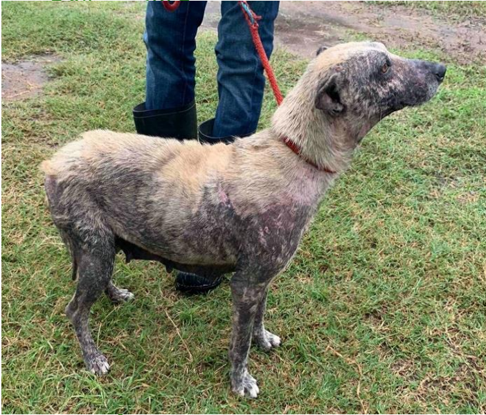
Day of arrival