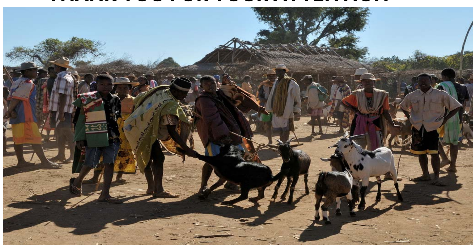
AU-IBAR: Providing leadership in the development of animal resources for Africa