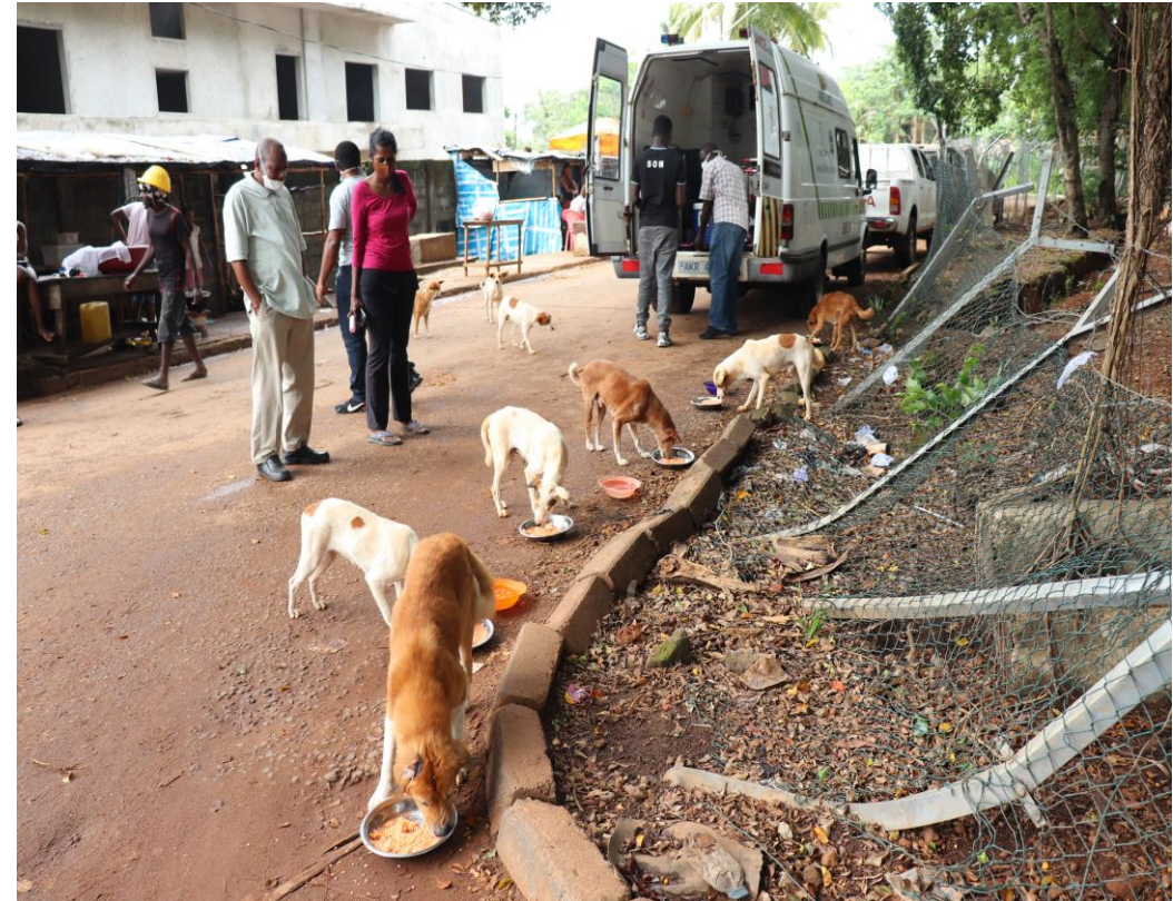
Sierra Leone Animal Welfare Society Feeding strays and abandoned dogs due to Covid-19