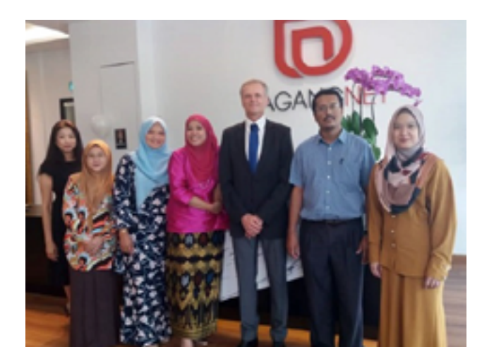
Meeting on NSW with Dagang Net