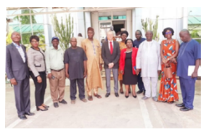
Department of Fisheries