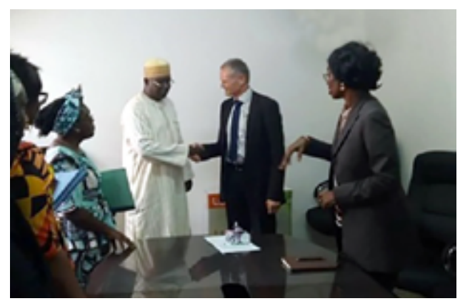
Courtesy call on the Permanent Secretary, Federal Ministry of Agriculture & Rural Development