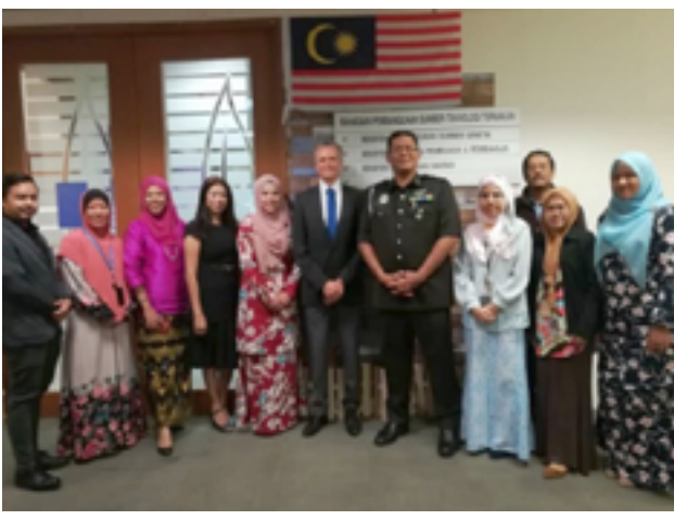
Closing meeting with Customs, Dagang Net, DVS and MAQIS