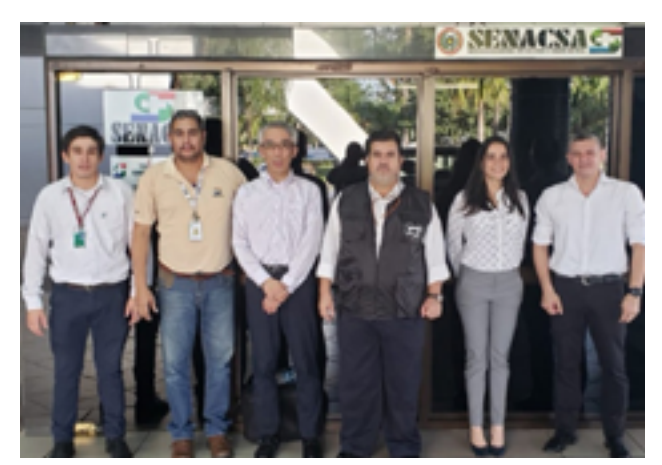
Visit to the International Airport in Asunción