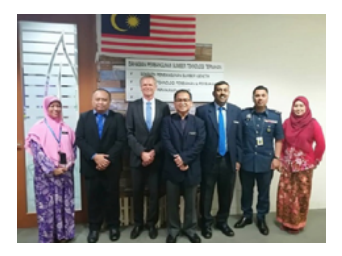
Opening meeting with DVS and MITI