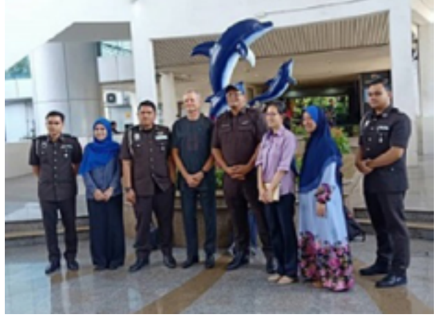
Meeting with MAQIS Westport