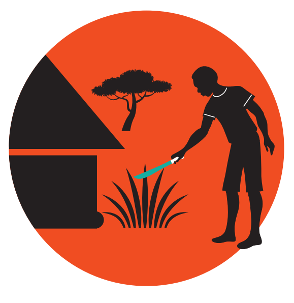
CUT ALL TALL VEGETATION near homes