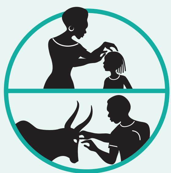
all over the body and remove them