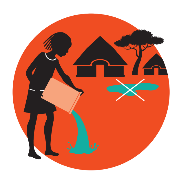
GET RID OF all stagnant water