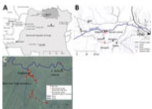
Figure 1. Locations of human Ebola virus (EBOV) outbreaks in Central Africa and capture site of potential wildlife reservoirs in study of role of wildlife in emergence of Ebola virus, Democratic Republic of...

The animal reservoir(s) for Ebola virus (EBOV) remain unclear. Although substantial evidence suggests several bat species can host EBOV and other filoviruses (1–8), it cannot be ruled out that other, less frequently surveyed mammal groups could also host these viruses or play a role in their ecology (9). An EBOV outbreak in humans implies that EBOV had been circulating among wildlife where the primary case-patient contracted the infection. If the primary case-patient and his or her activities before becoming ill are known, this information provides an opportunity for EBOV wildlife surveillance closely focused in space and season.