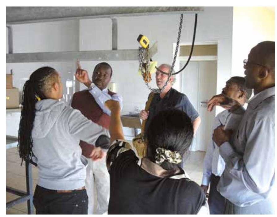
Visit to the necropsy facilities of the Central Veterinary Laboratory of the Veterinary Services Department in Manzini, during a PVS Evaluation follow-up mission to Swaziland in 2015

6. www.oie.int/index.php?id=169&L=0&htmfile=chapitre_eval_vet_serv.htm