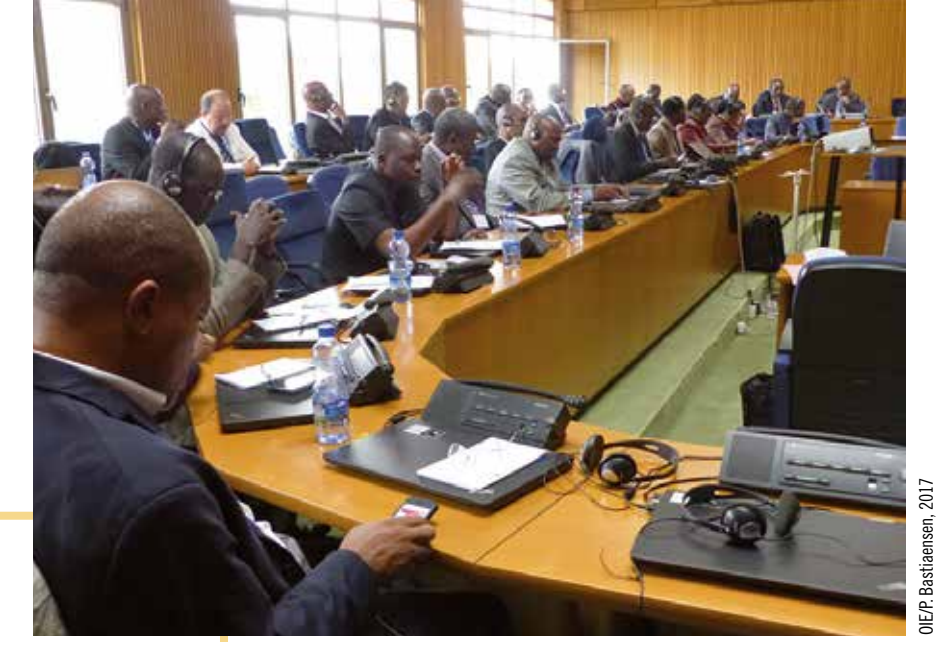
Session on the further development of the PVS Pathway, with OIE Delegates and other senior livestock officers, held during the high-level closing ceremony of the VETGOV Programme at the African Union headquarters in Addis Ababa, Ethiopia, 26–28 July 2017

In the space of less than five years, veterinary legislation has been brought to the forefront of veterinary governance at the national and (sub-) regional level, through an effective alignment of methodologies and approaches between AU–IBAR, the OIE and FAO.