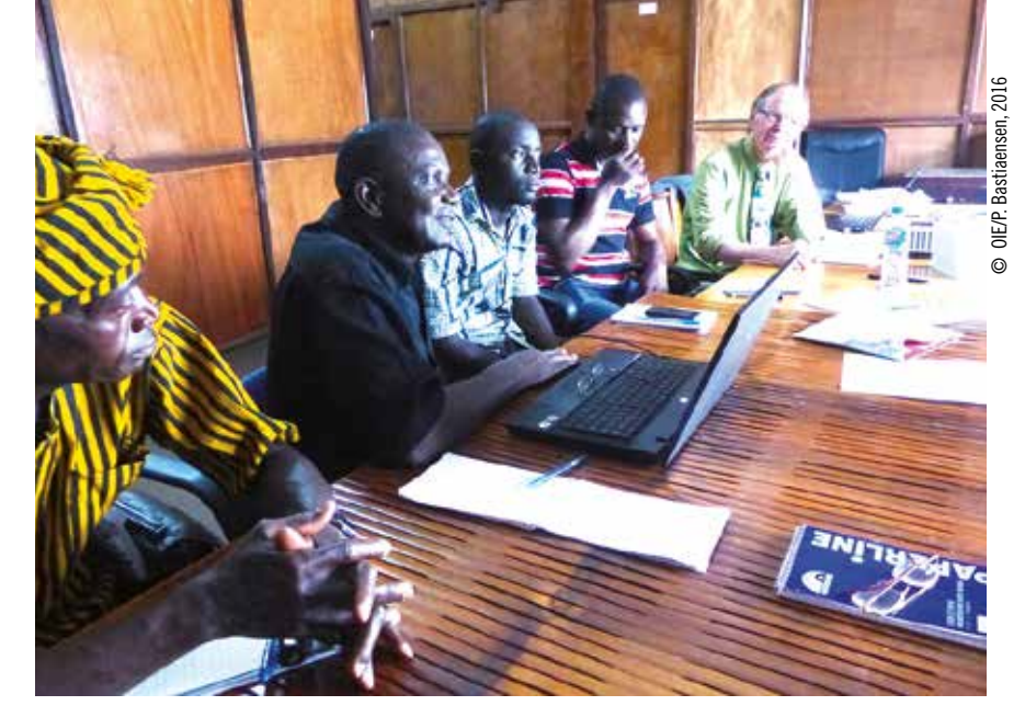
An OIE PVS Gap Analysis in Liberia, shortly after the end of the Ebola crisis (2016) Conducting interviews with livestock-sector stakeholders

The establishment of six additional Sub-Regional Representations of the OIE across the world, since the opening of the Botswana office in 2007, is in itself an illustration of how the OIE attempts to bring its governance closer to the Member States. 2007 was also the year in which the OIE, after a pilot phase in 2006, rolled out its PVS Evaluation missions. This 'Performance of Veterinary Services' (PVS) Pathway was designed to objectively measure compliance with the above list of 14 governing principles, in a variety of technical areas, as listed in Chapter 3.2. on the 'Evaluation of Veterinary Services' of the Terrestrial Code <sup>6</sup>.