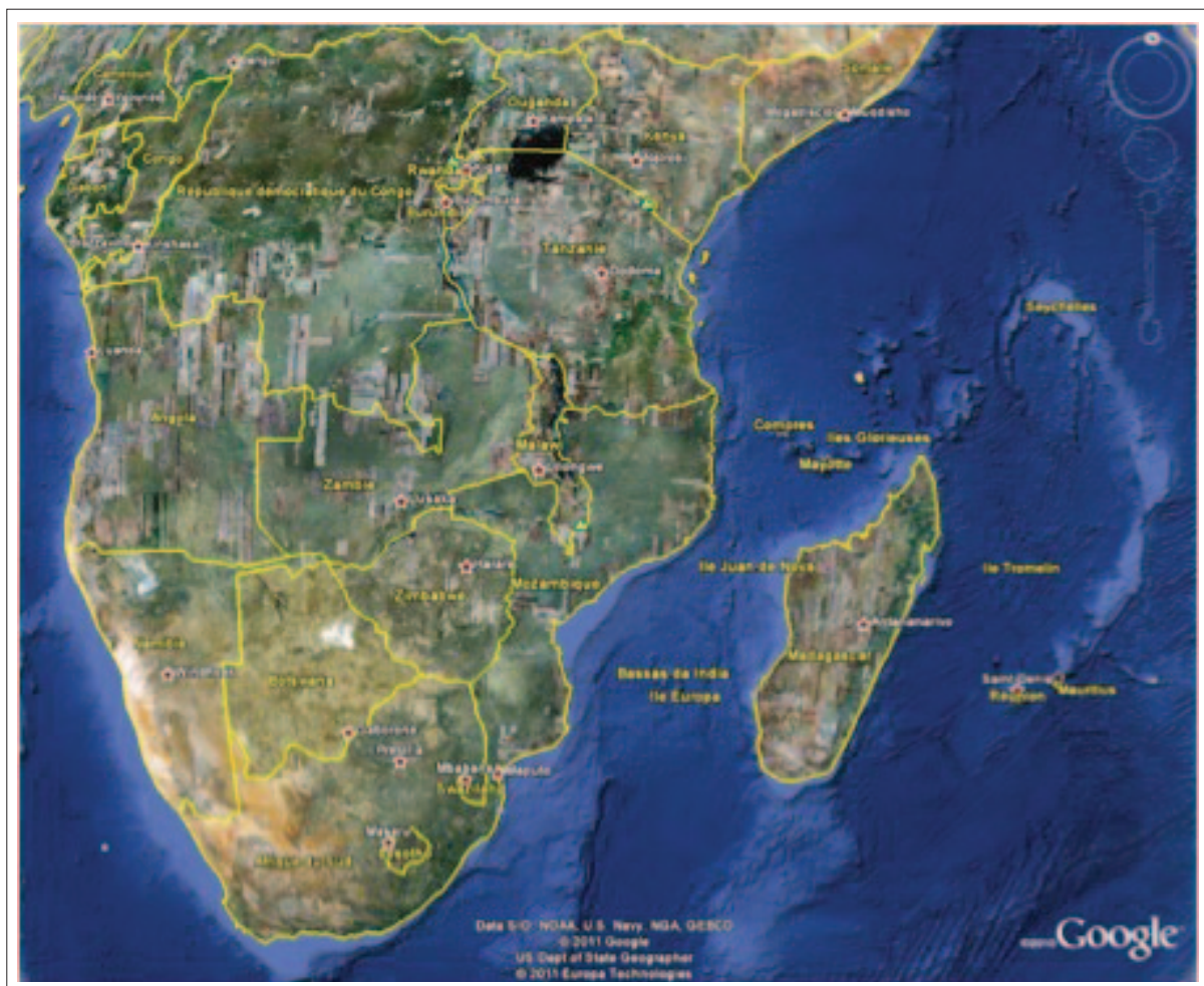
Satellite photo based rendering of southern Africa. SADC membership comprises Angola, Botswana, Democratic Republic of Congo (DRC), Lesotho, Madagascar, Malawi, Mauritius, Mozambique, Namibia, Seychelles, South Africa (Afrique du Sud), Swaziland, Tanzania, Zambia and Zimbabwe (c) Google (2011).

The countries concerned are the Member States of the Southern African Development Community (SADC). Currently SADC membership comprises 15 Member States namely Angola, Botswana, Democratic Republic of Congo (DRC), Lesotho, Madagascar, Malawi, Mauritius, Mozambique, Namibia, Seychelles, South Africa, Swaziland, Tanzania, Zambia and Zimbabwe.