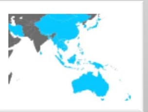
Asia & Pacific