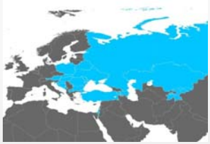
Central & East Europe