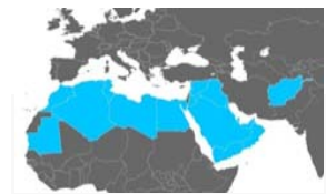
North Africa & Middle East