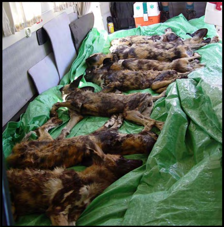
Relevant international conventions - CITES I, II and III