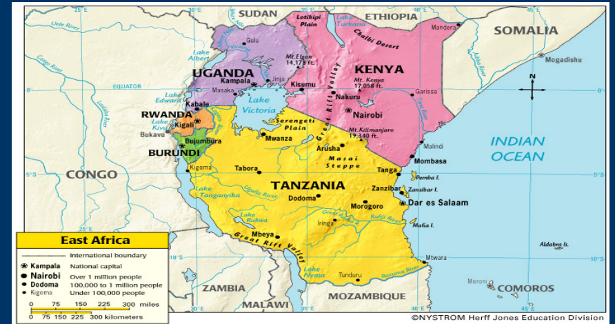
EAC East African Community