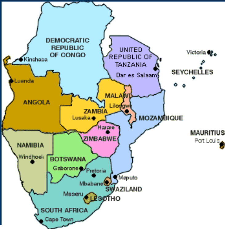
SADC Southern Africa Development Community